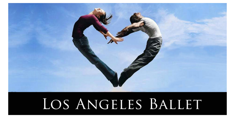
A Chance to Dance Community Day

A Chance to Dance (ACTD) provides one day of free classes per month, for 10 months, at the LAB Center in West L.A. LAB's professional dancers teach a variety of dance classes, give informal performances and coordinate wellness lectures. ACTD promotes knowledge of dance, a healthy lifestyle, confidence and joy. In LAB's 2015/2016 Season, 1,200 individuals participated in ACTD, (or 120 per ACTD event). Participants from schools, arts organizations, and social service agencies are invited to participate. Registration is open to all, with classes offered to a variety of age groups.